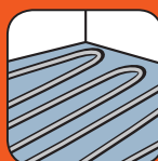
OK for infloor heating