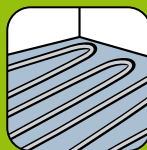
OK for in-floor heating