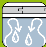
Moisture barrier integrated