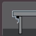
Sticks to everything